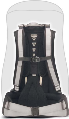
EXACT FIT® Mid

ONE PLANET® EXACT FIT® Mid packs are available in three harness sizes. Each pack can be adjusted to ensure a comfortable, exact fit.