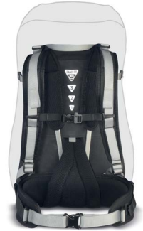
EXACT FIT® Mid Lite

The primary purpose of the shoulder straps is to stabilise and balance the upper pack, not to carry all of the weight. The shoulder straps are shaped so that weight is distributed evenly and over a large surface area, eliminating discomfort from pressure points.